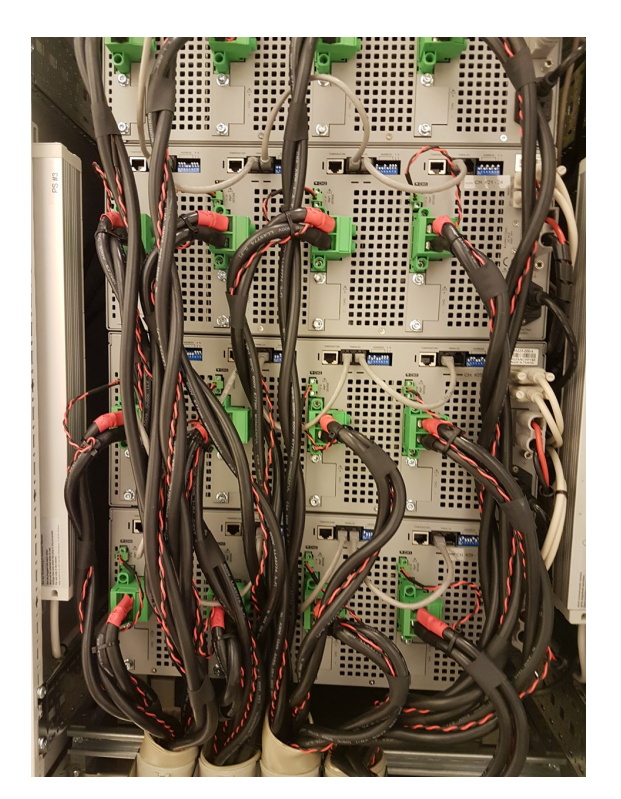
Four wire connection for each channel to allow compensation of voltage drop along cable