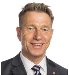
Terje L. Aasland Minister of Petroleum and Energy