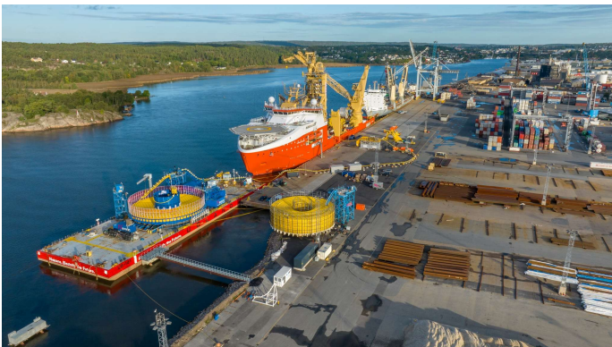
Port of Borg