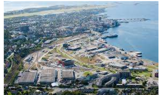
Port of Bodø