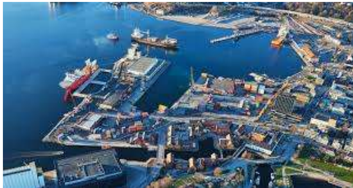
Port of Kristiansand