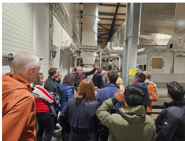
Workshop participants visiting the OBIO AS pyrolysis plant at Rudshøgda.

The third BioCarbUpgrade workshop and SC meeting was arranged at Wood Hotel in Brumunddal on 16-17 October 2024. In the meeting, the project and its activities were presented and discussed. During the meeting a tour of the OBIO AS pyrolysis plant at Rudshøgda was arranged.