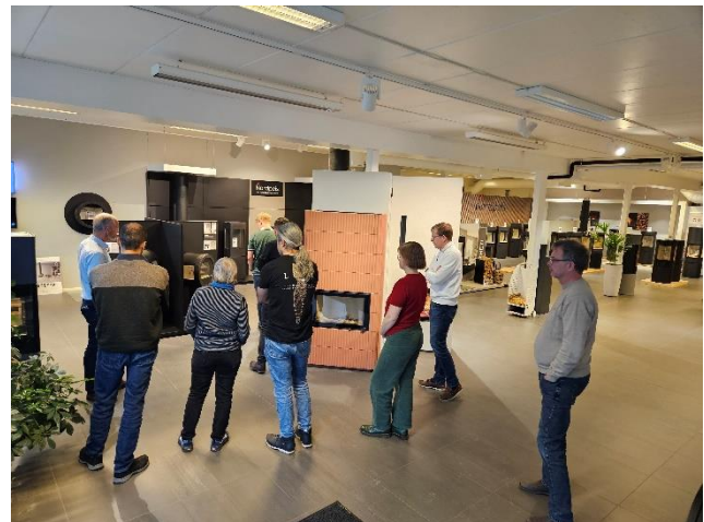
Workshop participants in the showroom at Nordpeis

The seventh workshop and SC meeting were arranged in Trondheim, 27-28 November 2024. This was the sixth physical consortium meeting in the project, with many interesting presentations and discussions on the workshop agenda, and the event was hosted by Nordpeis AS.